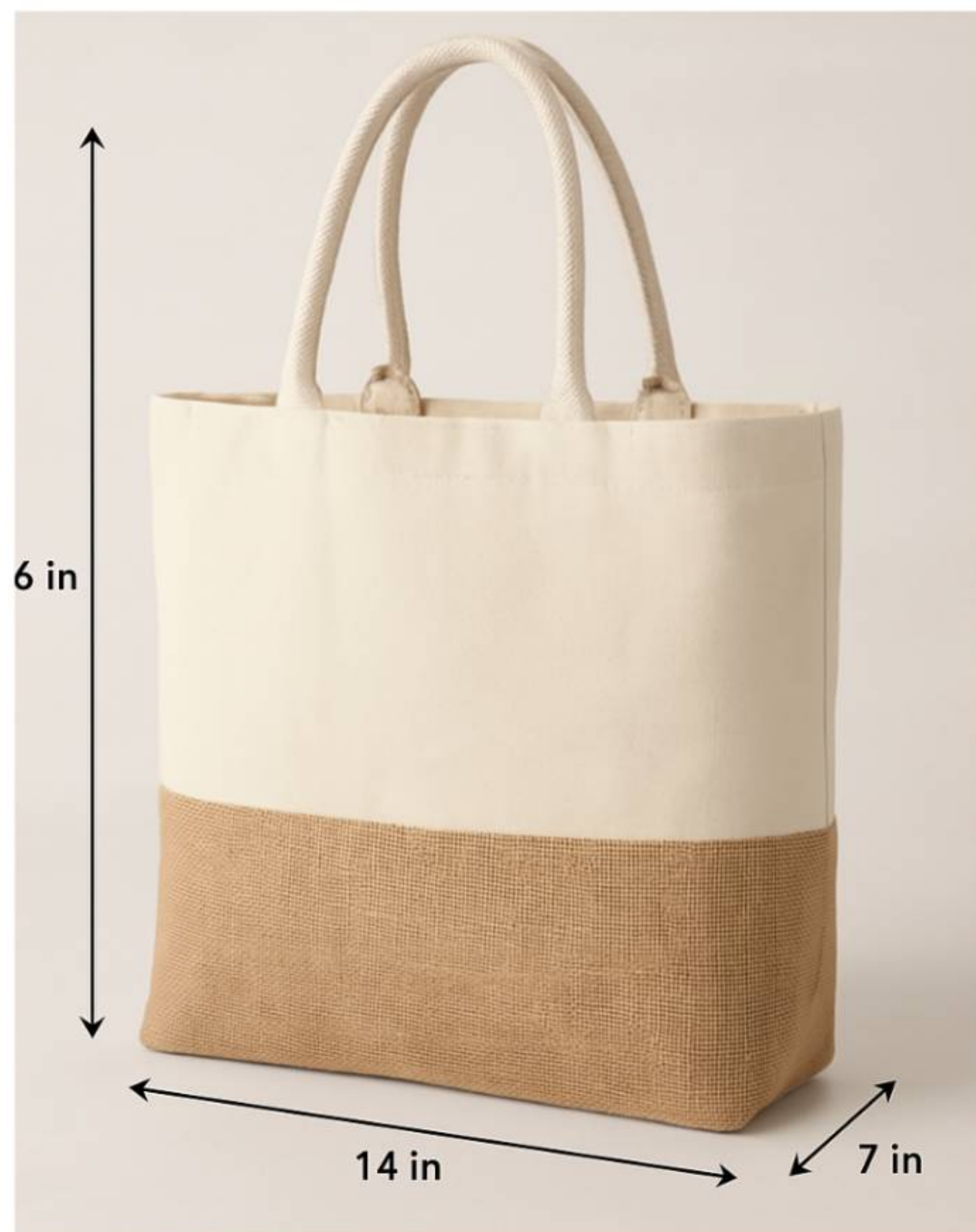
Model No.: JB21