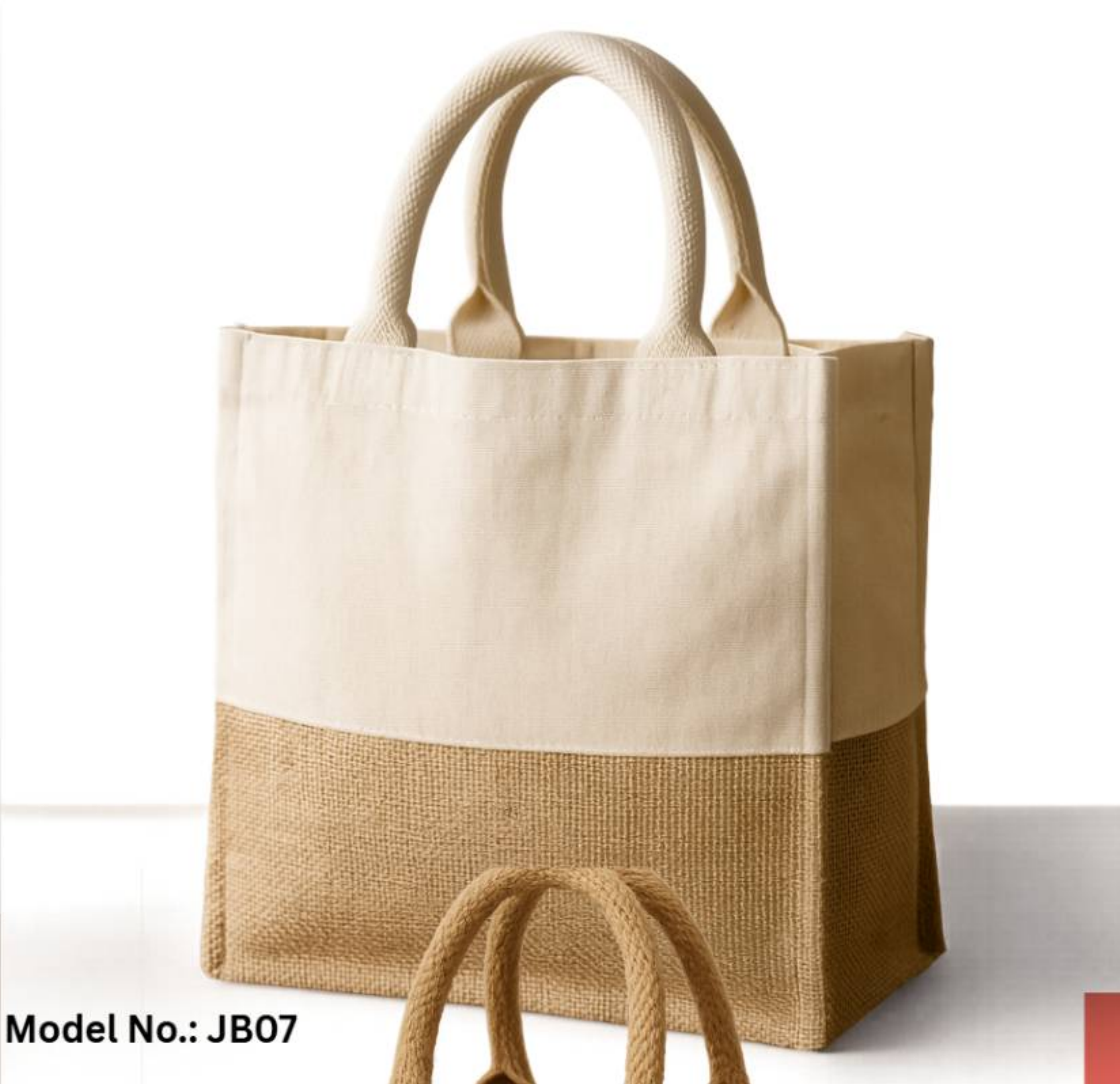
Model No.: JB07

Our jute bags are 100% biodegradable, reusable, and made from natural plant fibers— an eco-friendly alternative to plastic that helps reduce pollution and support a greener planet.