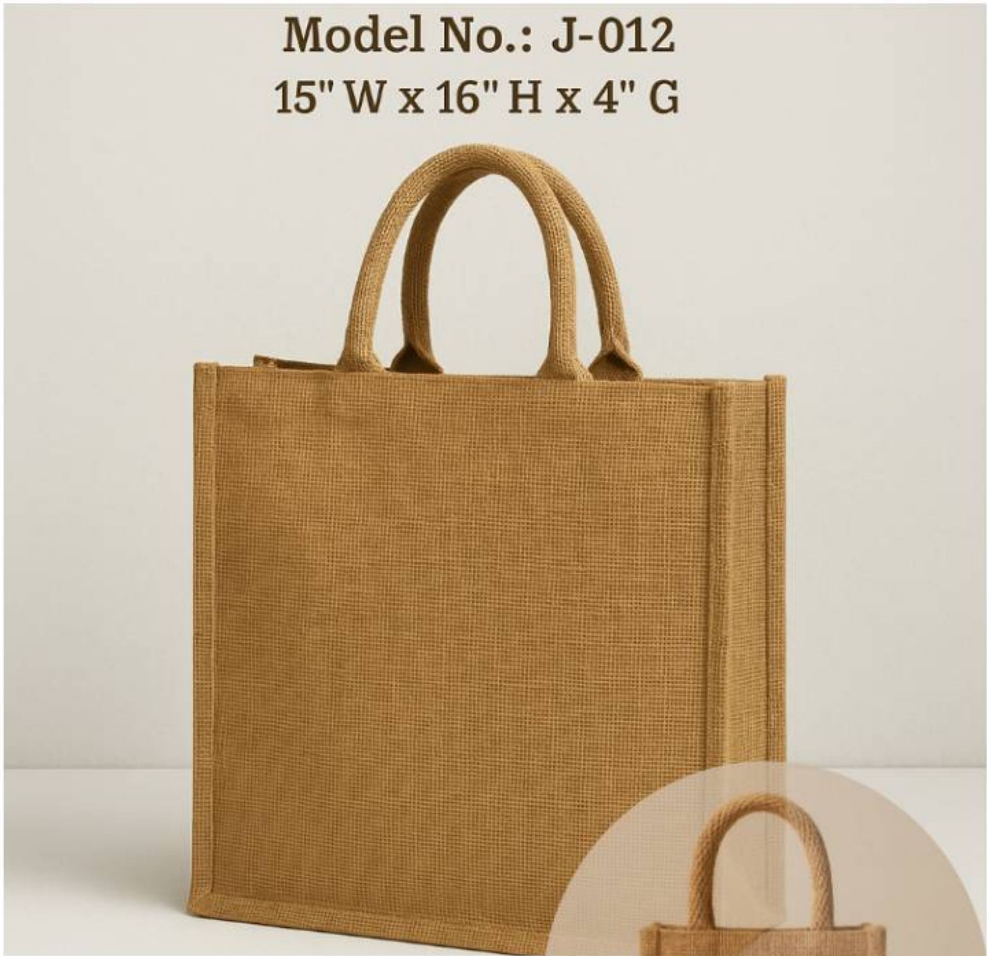
Model No.: JB03

Eco-friendly jute bags crafted for style, strength, and sustainability.