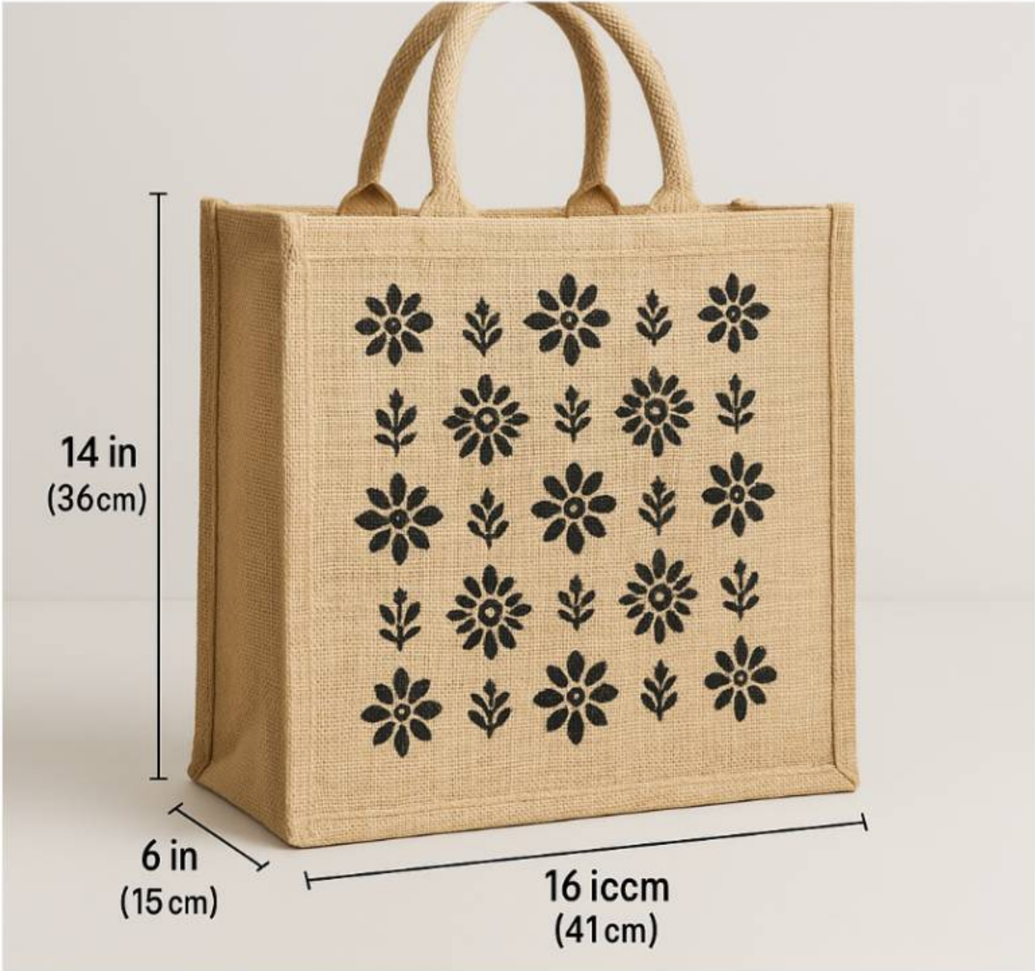
Model No.: JB16

Made from natural fibers, our jute bags are 100% biodegradable and decompose without harming the environment."