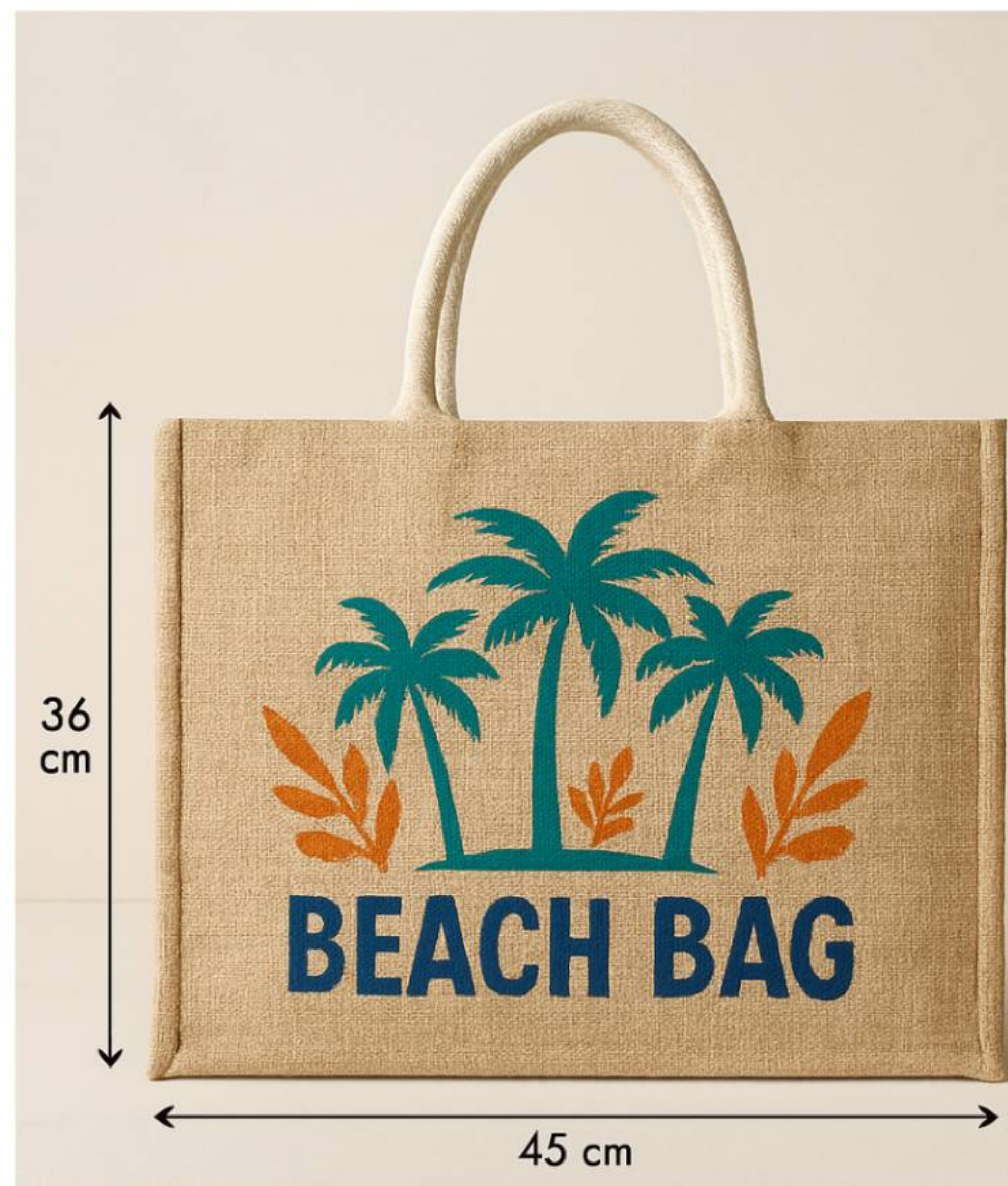
Model No.: JB22