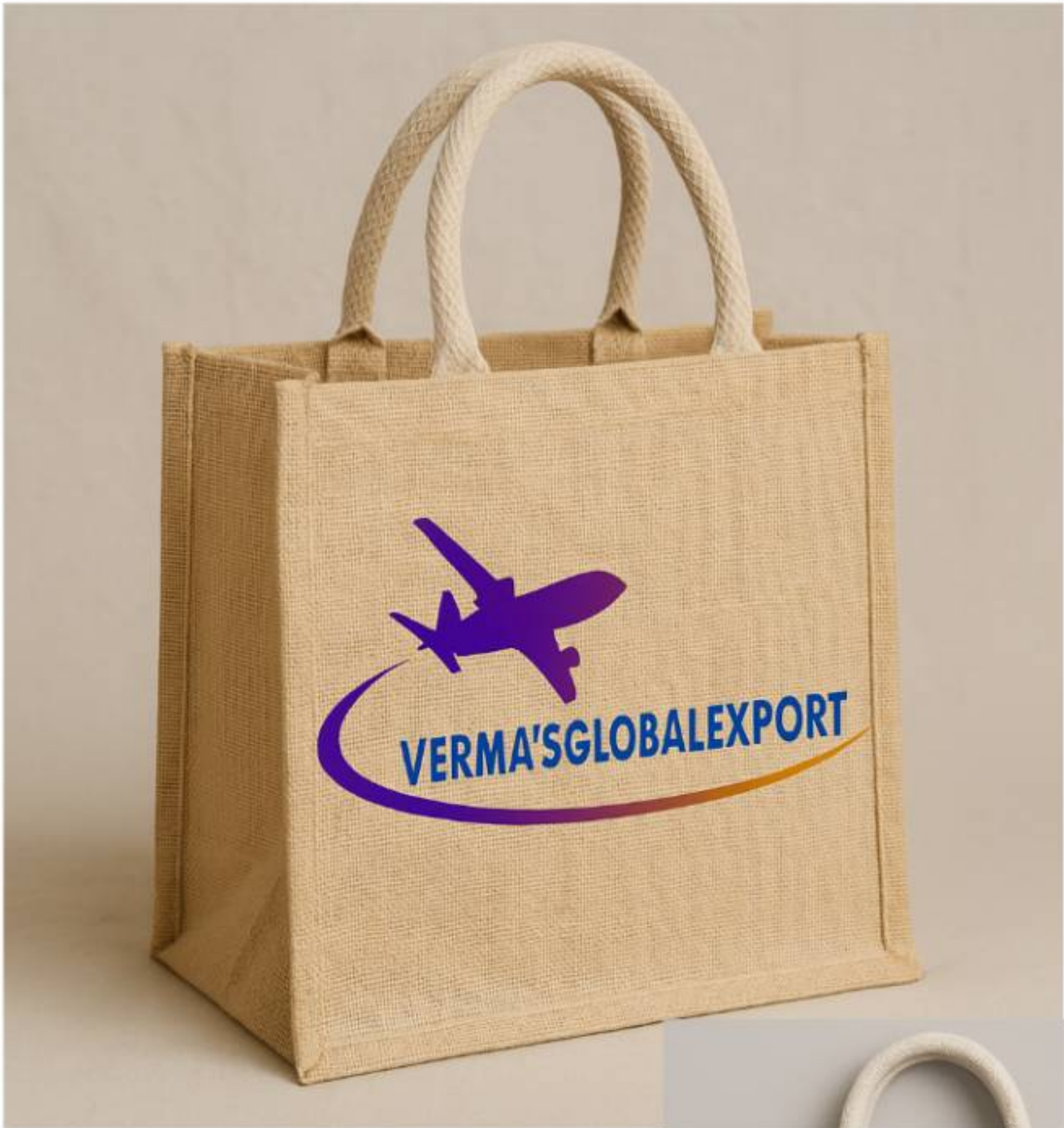
Model No.: JB06

cotton jute bags crafted with durable fabric, offering strength, eco-friendliness, and a natural, elegant finish.