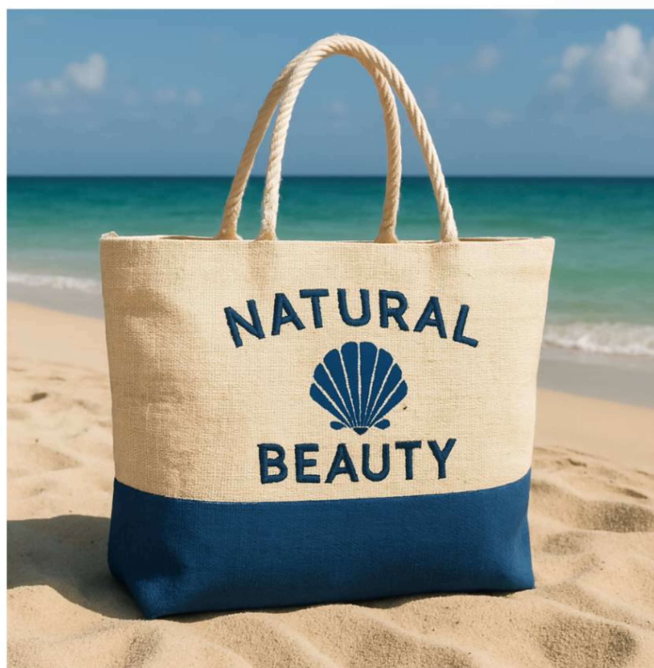
Model No.: JB23

our beach jute bags are the perfect eco-friendly companion for your sunny adventures. a biodegradable design, they're not just trendy —they're planet-friendly too!