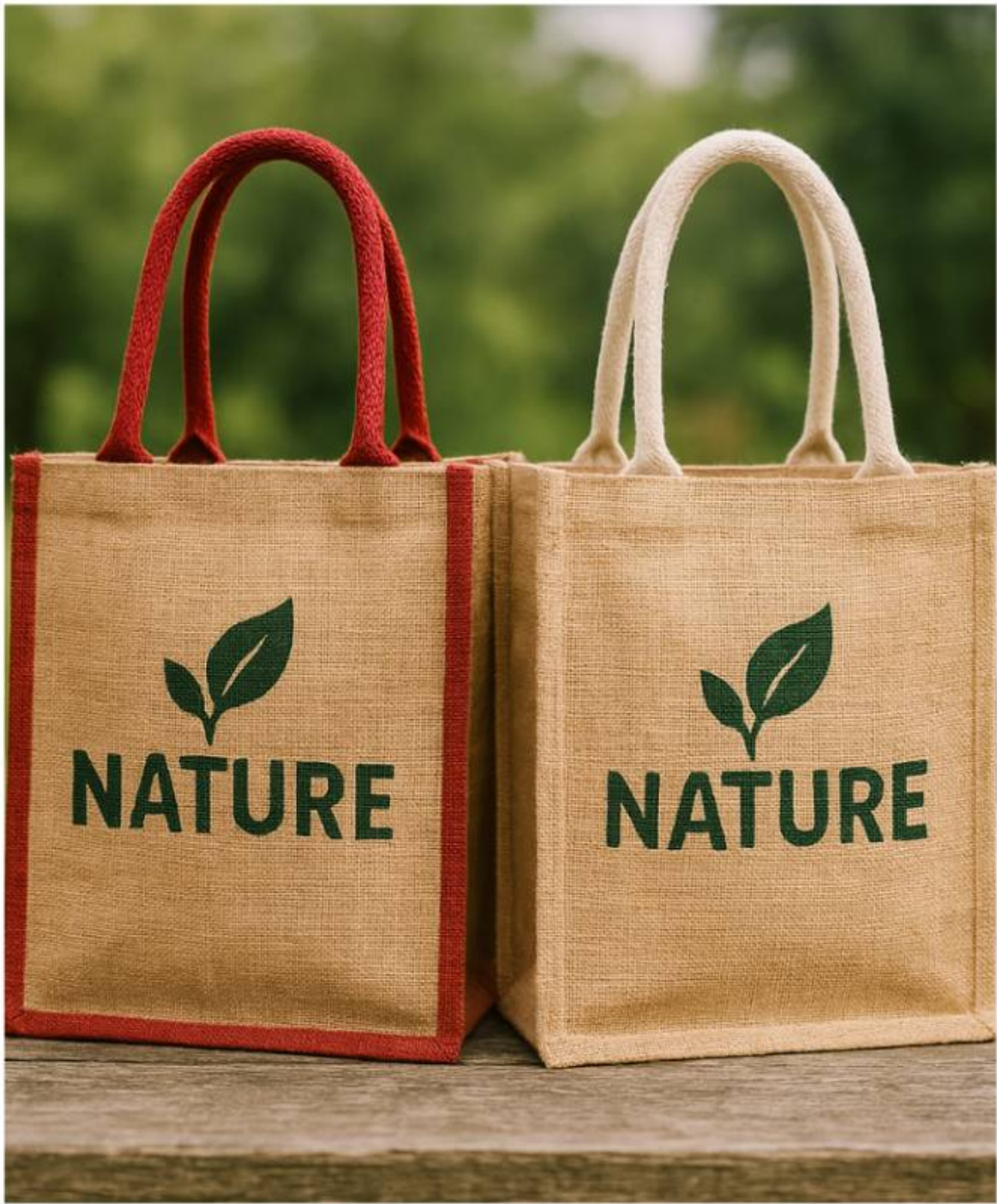
Model No: JB-01

“Naturally Strong, Beautifully Sustainable.”