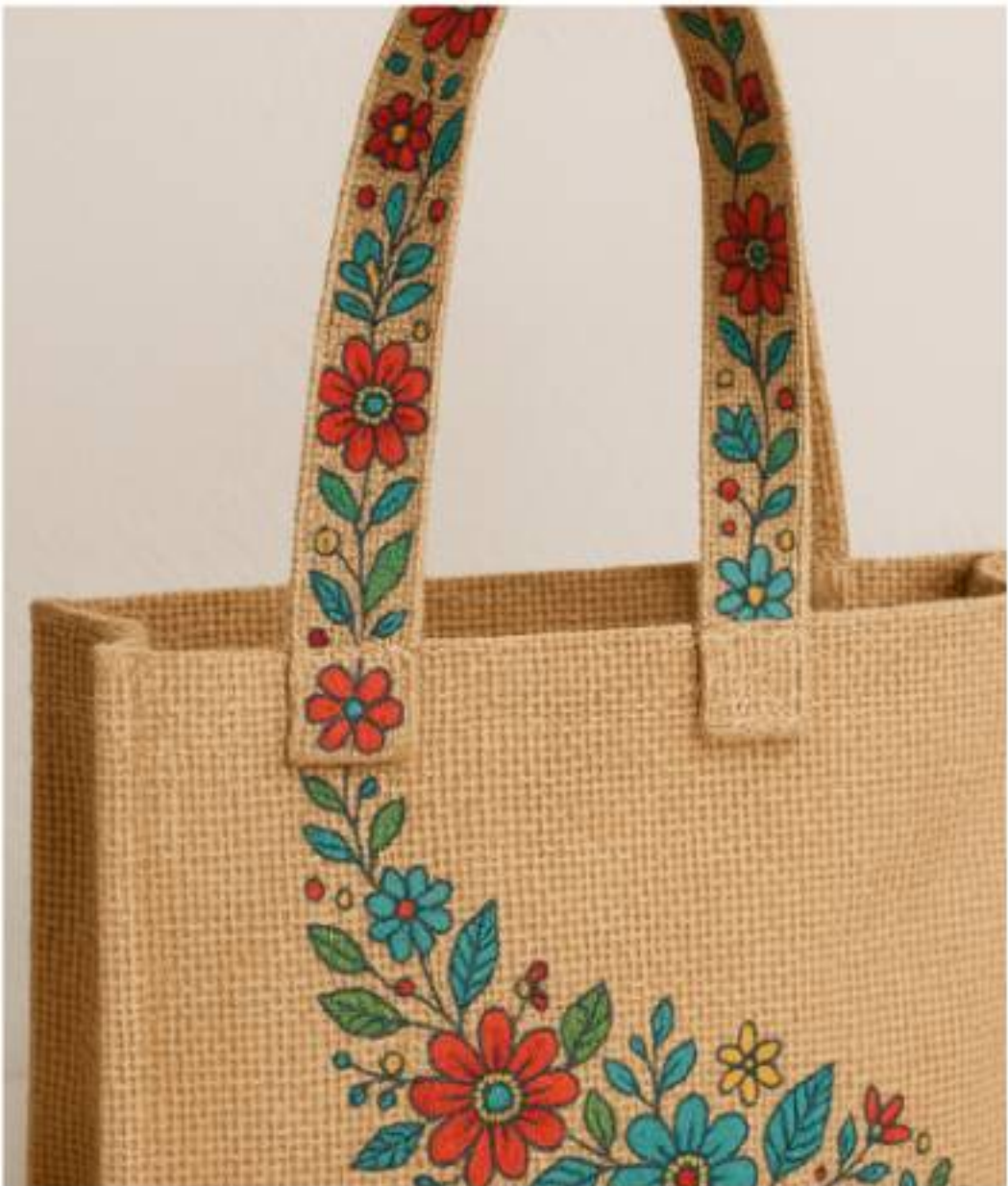
Model No.: JB18

Made from natural fibers, our jute bags are 100% biodegradable and decompose without harming the environment."