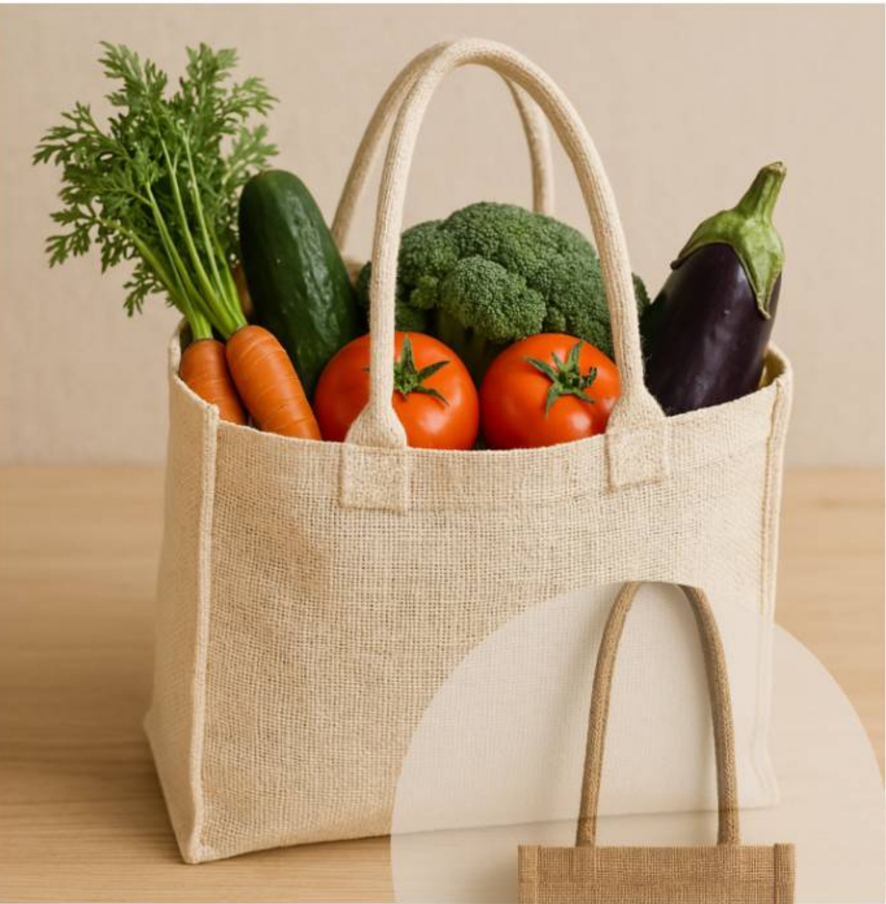
Model No.: JB02