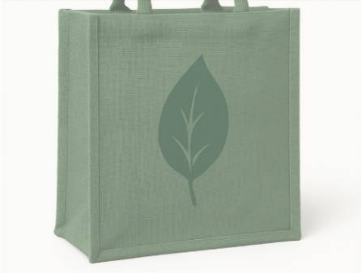
Model No.: JB19