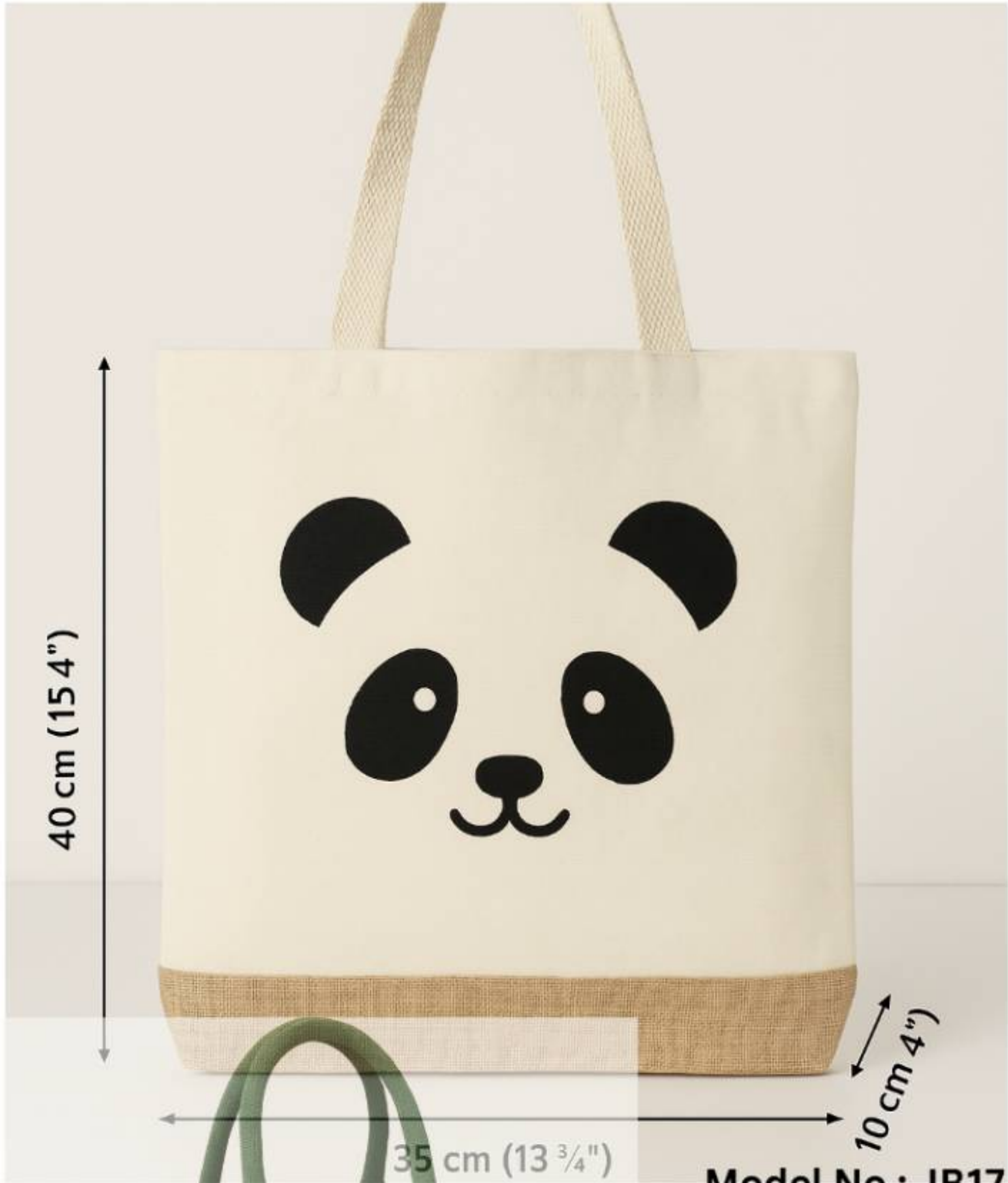
Model No.: JB17