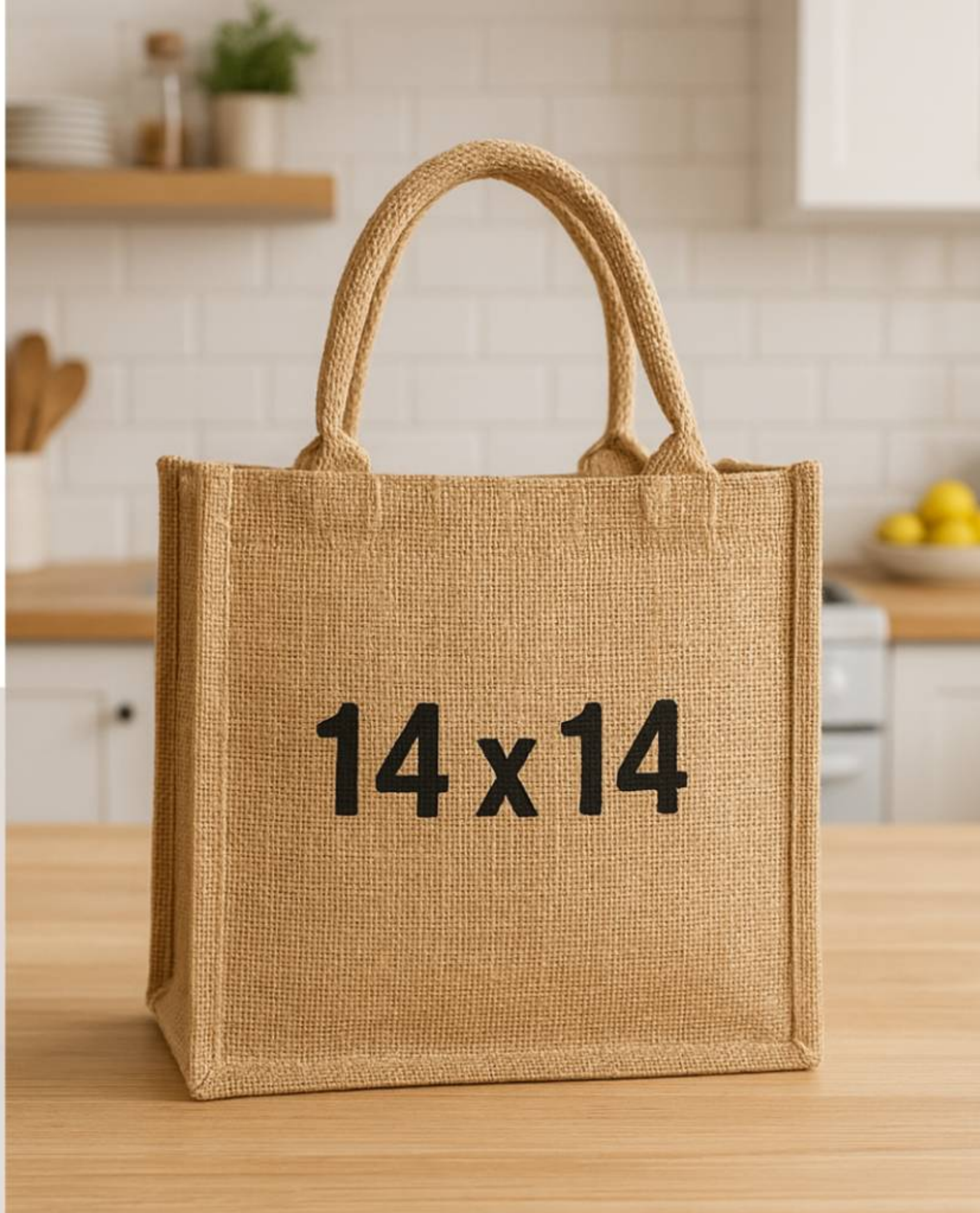
Model No.: JB05

cotton jute bags crafted with durable fabric, offering strength, eco-friendliness, and a natural, elegant finish.