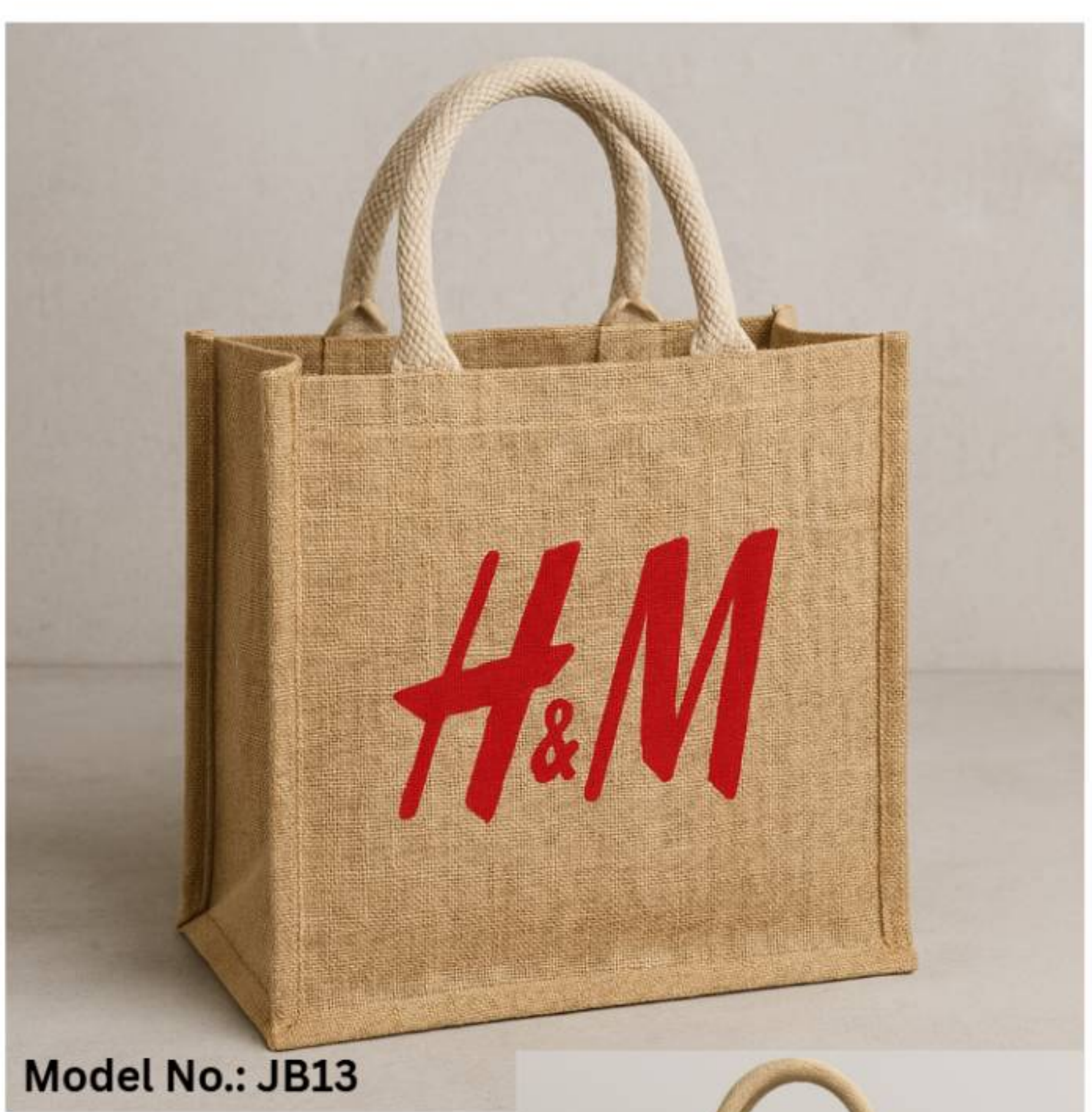
Model No.: JB13