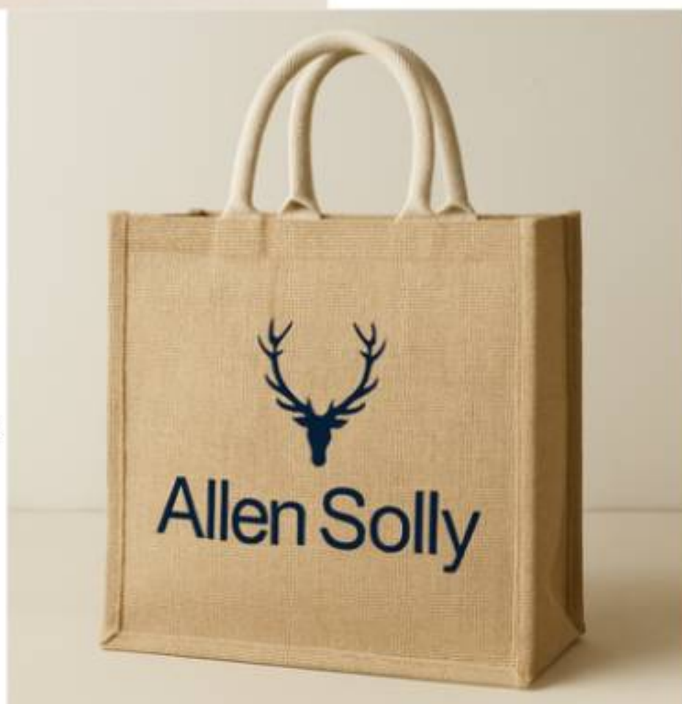
Model No.: JB14