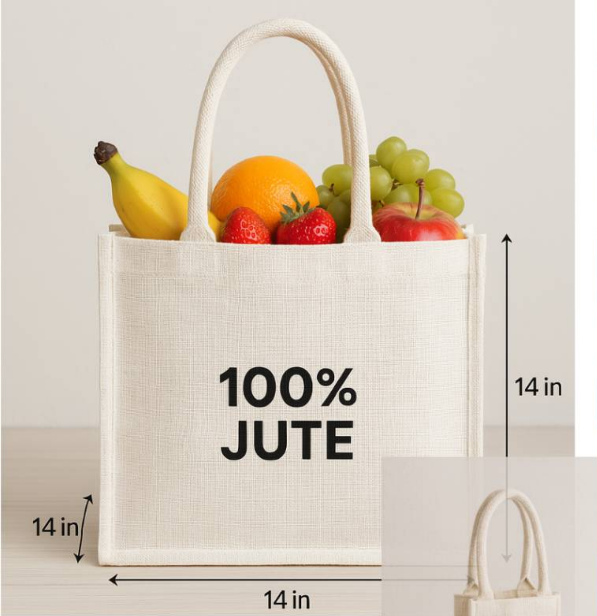
Model No.: JB04