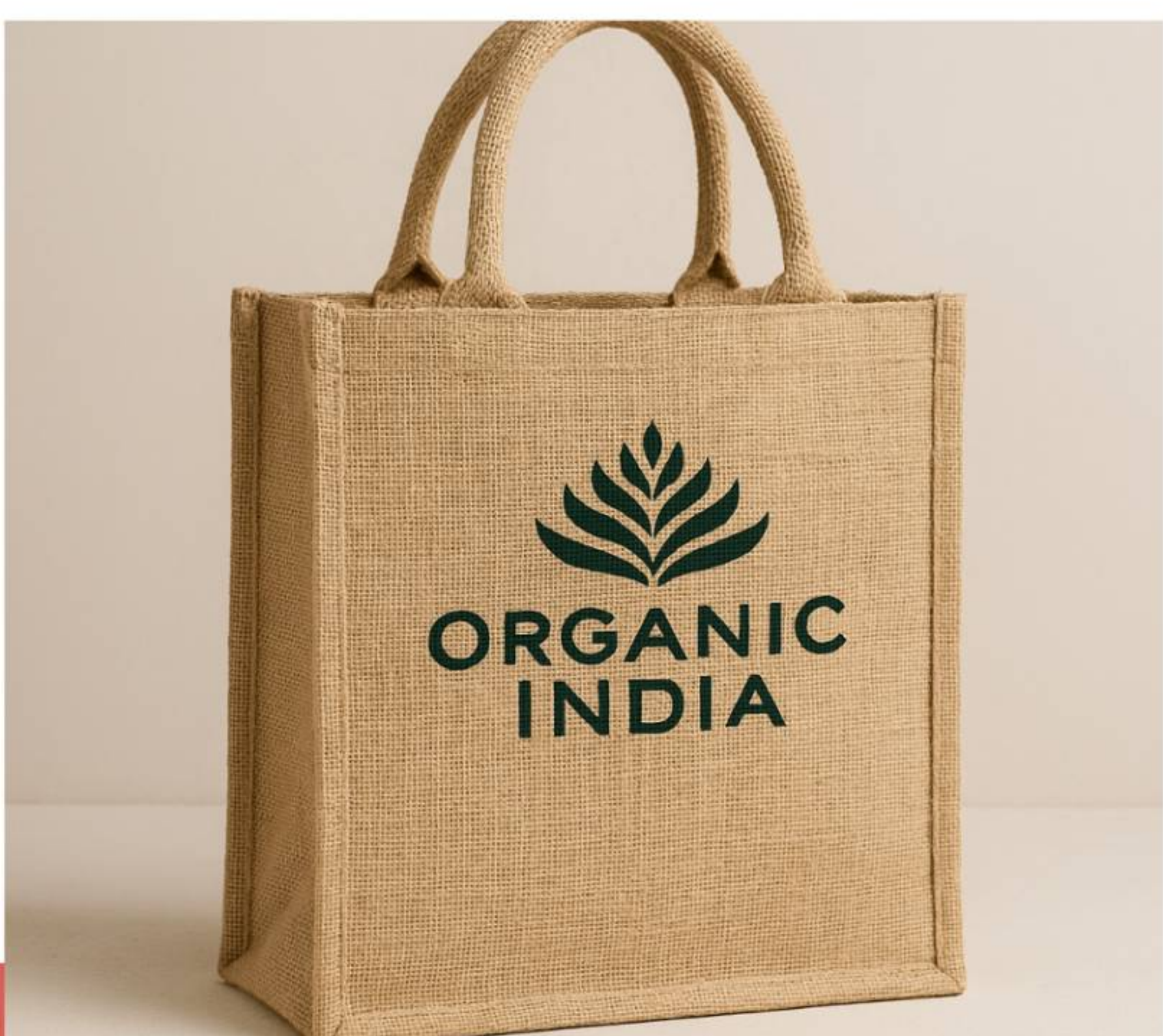
Model No.: JB12