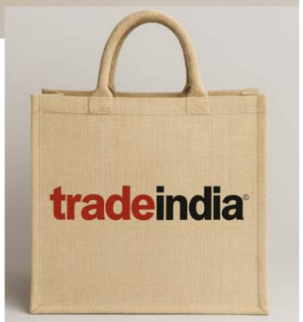
Model No.: JB15

Jute bags offer a sustainable way to promote your brand with style, visibility, and eco-conscious impact.